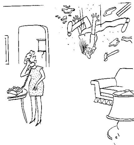
"My husband's on the roof... Oh, wait! Here he comes now!"